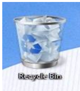
Fig 3.4 Showing the Recycle Bin.