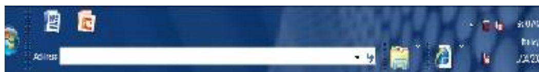
Fig 3.2 Showing the Taskbar.