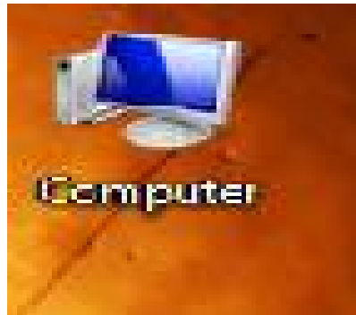
Fig 3.3 Showing the My Computer